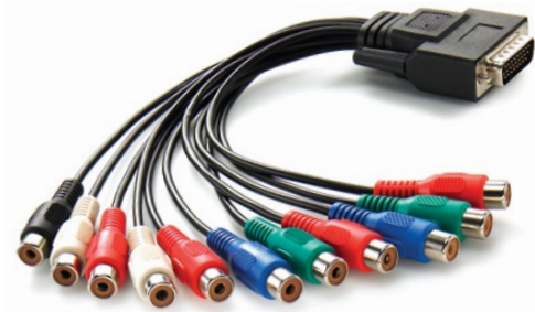
Breakout Cable (Analog video and audio connections)